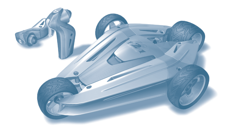
Toy remote controlled car concept courtesy of Niall Hamilton, UK.

"Pro/CONCEPT allows me as a designer to quickly workup and visualize broad ideas. It removes the hassle of learning and maintaining multiple tools to accomplish concept design. Plus, it's just fun to use!"